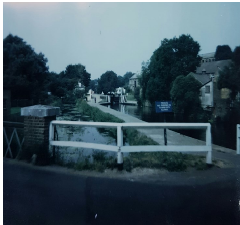
Photos from 1974 prior to Coppermill Lock Conservation Area designation, including examples of unattractive industrial buildings which have since been replaced.