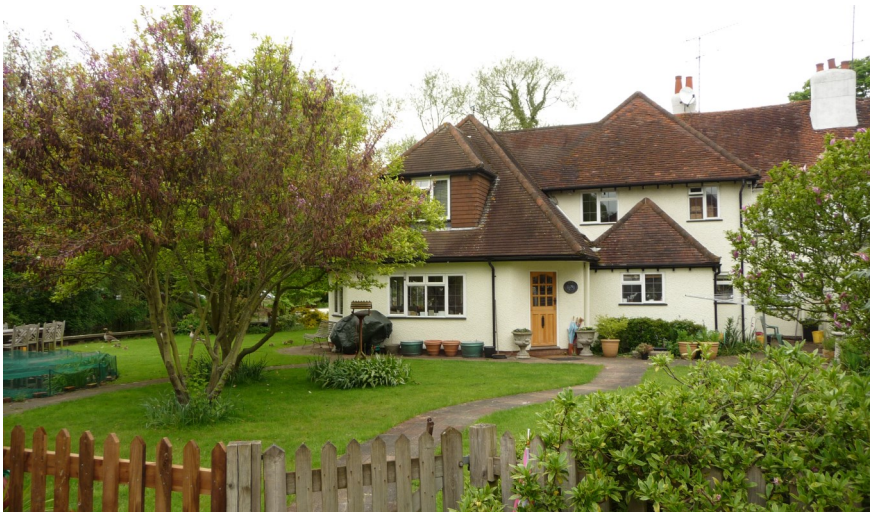
Left: Fishery Cottages