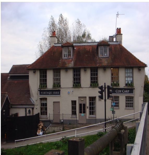
Below: Coy Carp Public House