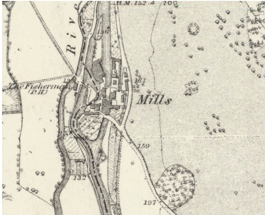
Ordnance Survey map from 1868 showing the Fisherman Public House (now Coy Carp) with the fishery cottages to the south and the Harefield Mills on the opposite side of the canal