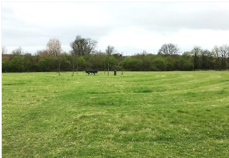
Photo 1: A wildflower maze established at an East Herts District Council park – photo taken in April, before flowering season.