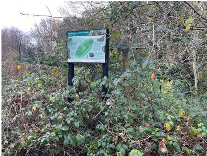
Figure 6 Interpretation board by Compartment 5

There is currently an interpretation board in the northeast of Compartment 5, however this is set far back from the path and is surrounded by brambles. It is also at a height which is not suitable for a range of site users. The vegetation around this should be cleared and the sign should be brought forward and installed so that it sits lower off the ground.