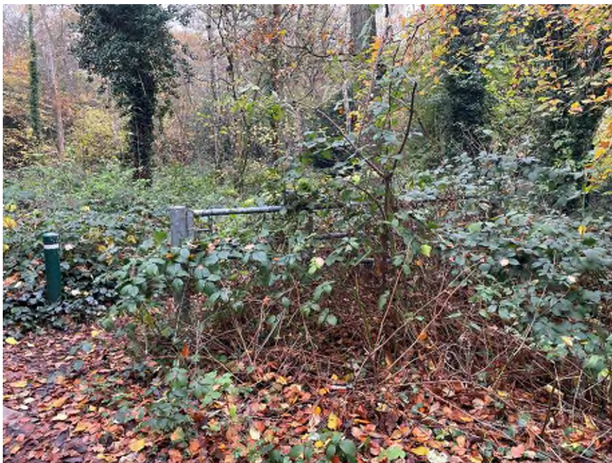
Figure 3 Entrance of All Saints Road

Another entrance requiring improvements is the entrance off All Saints Lane into Compartment 1. There is currently a vehicle gate that is overgrown and has become an eyesore and unable to be used. The vegetation should be cleared around this and the vehicle gate removed and replaced with lockable bollards to retain vehicle access into this area of the woodland.