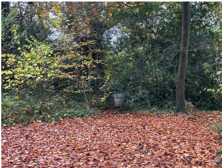
Figure 4 Bin on All Saints Road

At the entrance to Compartment 1 further south along All Saints Road there is a bin which is old and outdated and does not fit the site furniture seen elsewhere at the site. This should be removed and replaced with a new bin.