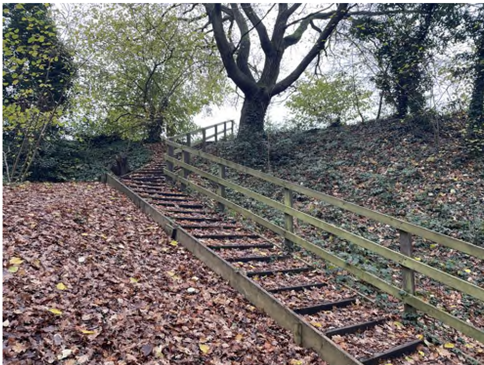
Figure 1 Steps into Long Valley Wood

During the previous plan, the ladder steps were replaced in Long Valley Wood, replacing the older existing steps that were falling into disrepair. This has allowed continued access to this compartment for the public. These remain in a good condition, however, will continue to be monitored and spot repairs will be carried out if necessary.