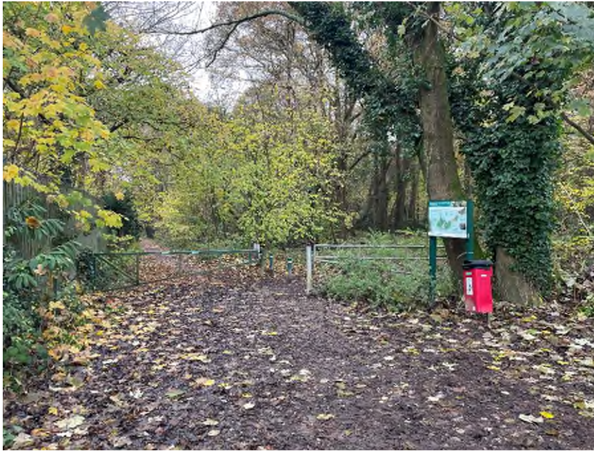
Figure 2 Entrance off Harvey Road

Another entrance requiring improvements is the entrance off All Saints Lane into Compartment 1. There is currently a vehicle gate that is overgrown and has become an eyesore and unable to be used. The vegetation should be cleared around this and the vehicle gate removed and replaced with lockable bollards to retain vehicle access into this area of the woodland.