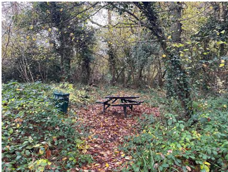
Figure 5 All Saints Road Picnic Area

Also along All Saints Road, there is a picnic area which is not well utilised. The bench and litter bin present in this picnic area could be better served elsewhere. These should be removed and relocated to a more appropriate area of the woodland. The exact location for the relocation should come as a result of discussions with the users of the site to ascertain the most appropriate location.