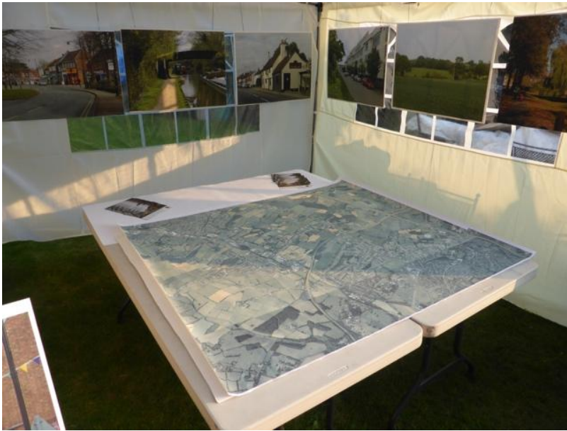
Large-scale map aerial photo used at the public exhibition