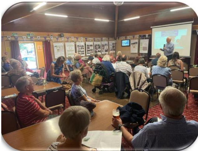
Image from the Public Workshops