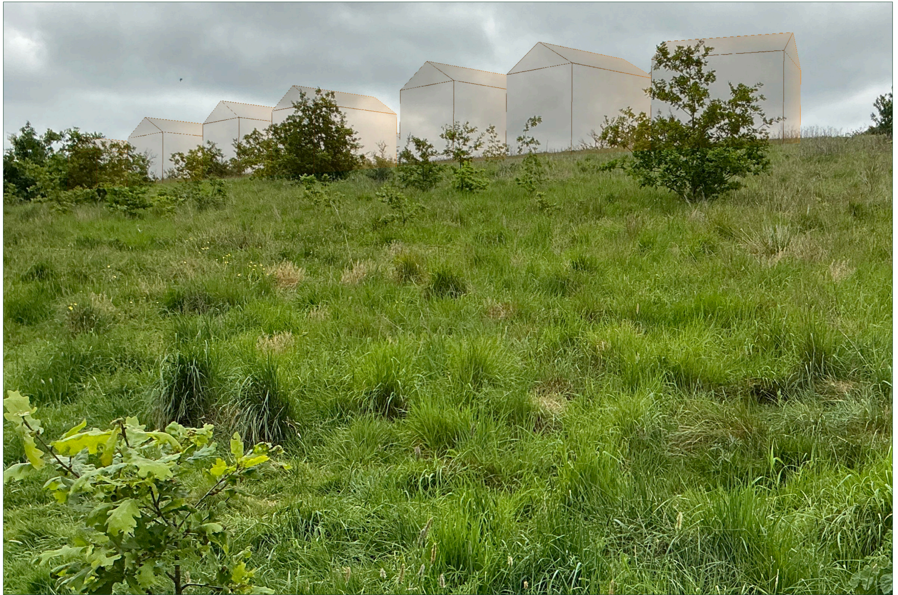
Viewpoint 1 - Footpath through Site (west), left - 512677, 193629