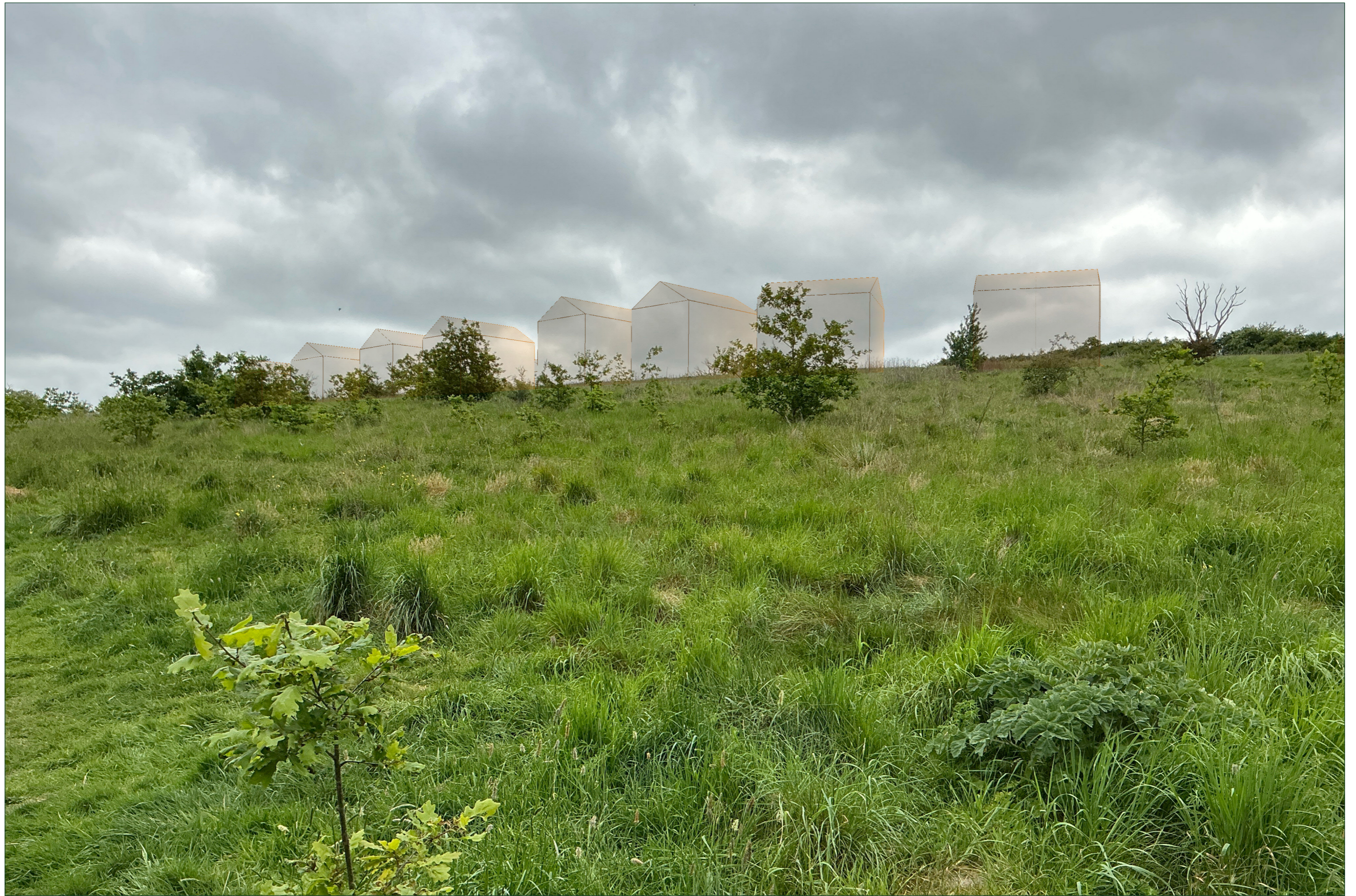
Viewpoint 1 - Footpath through Site (west), left - 512677, 193629