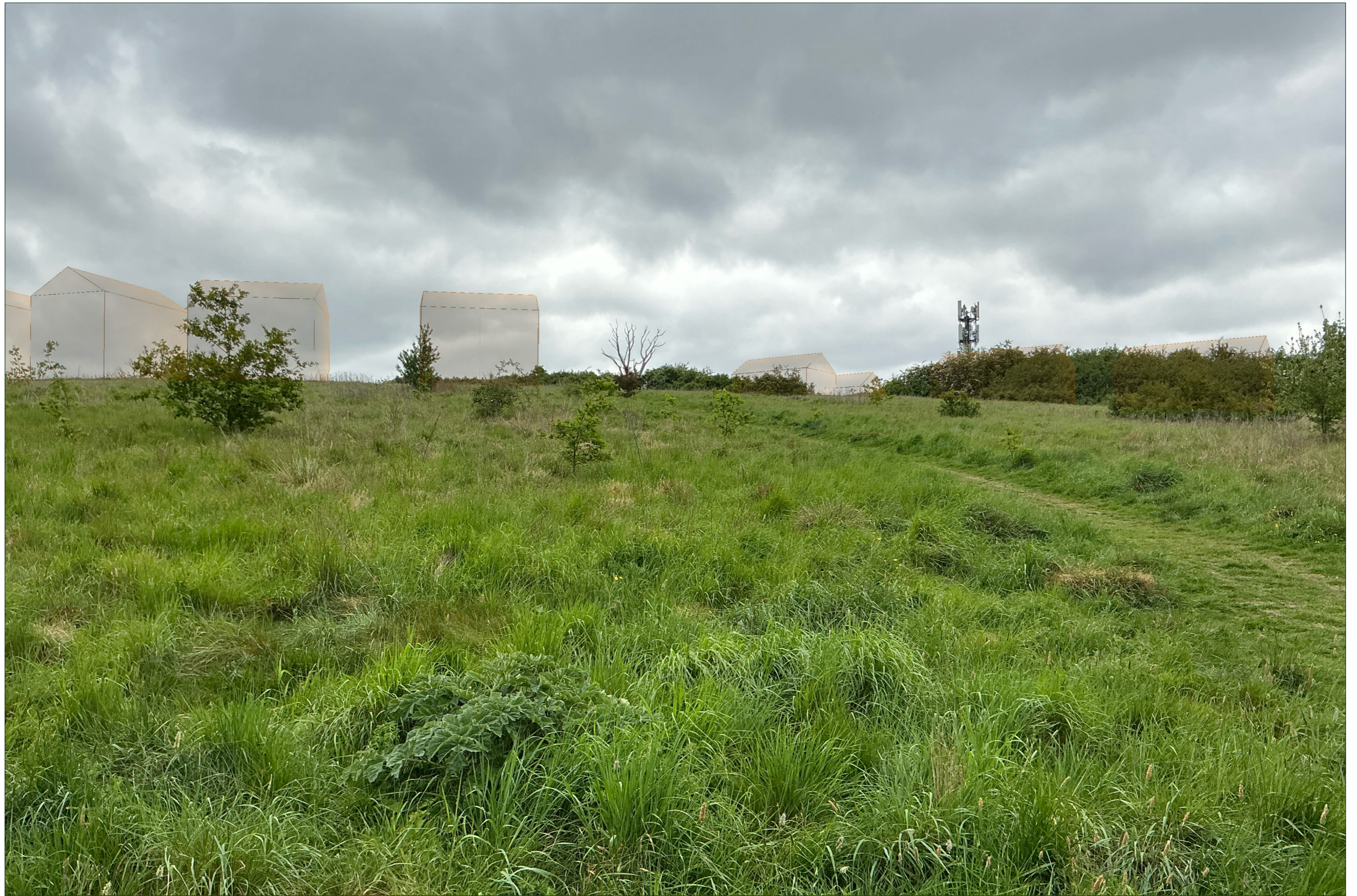
Viewpoint 1 - Footpath through Site (west), right - 512677, 193629