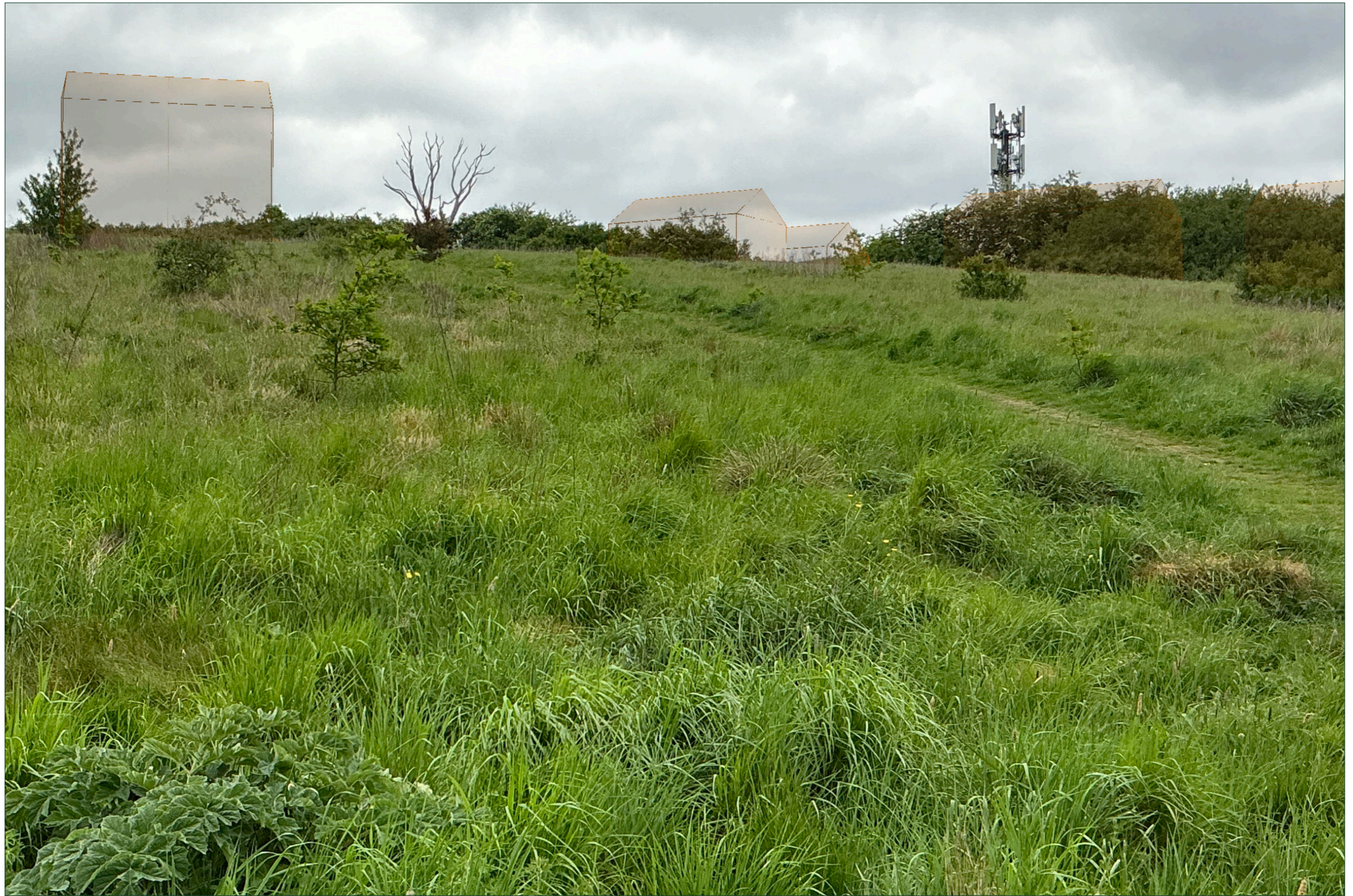
Viewpoint 1 - Footpath through Site (west), right - 512677, 193629