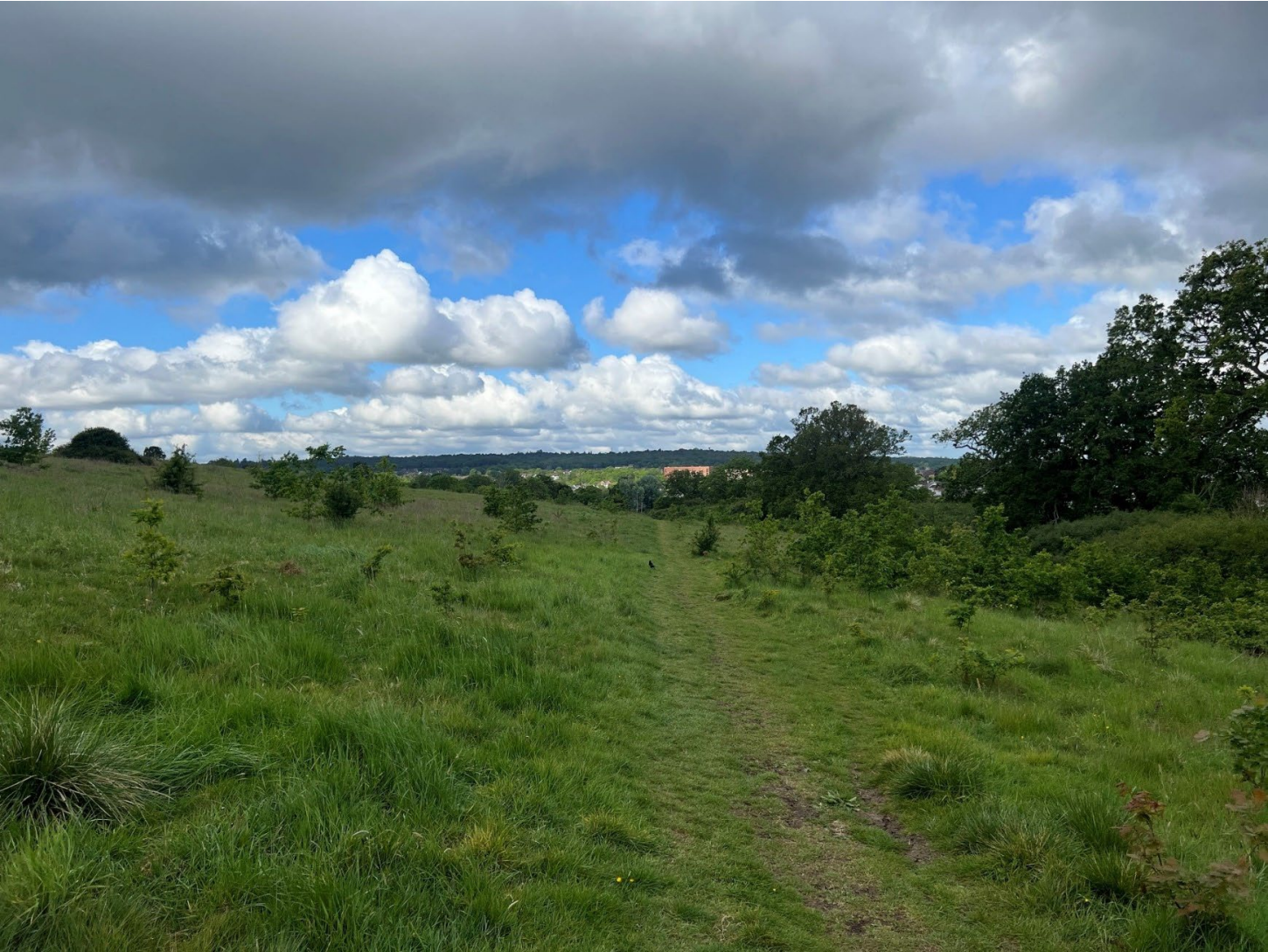
Site photo 1 (May 2026) viewpoint west from PROW