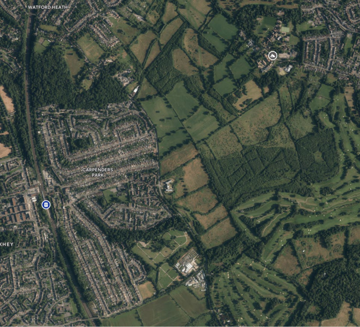
Aerial view of Carpenders Park, the site and Green Belt (OS Mapping)