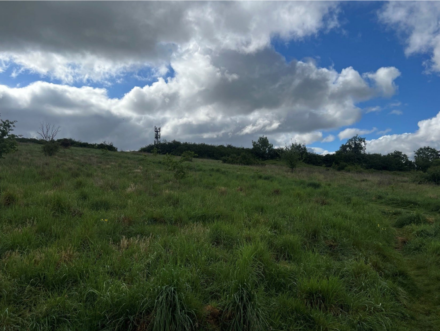
Site photo 3 (May 2026) viewpoint southeast from PROW towards telecoms mast