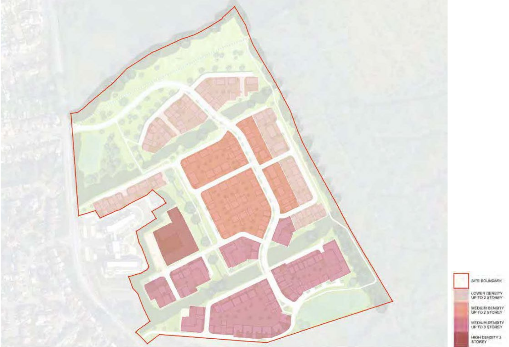
Building Heights Plan DAS page 44