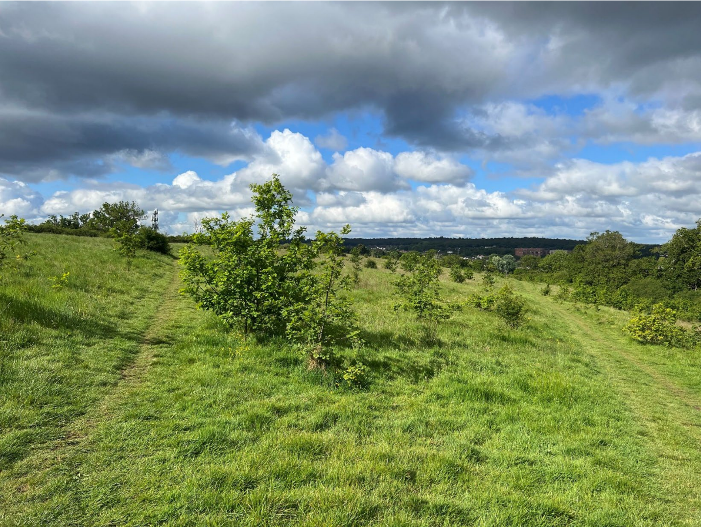
Site photo 2 (May 2026) viewpoint west from PROW