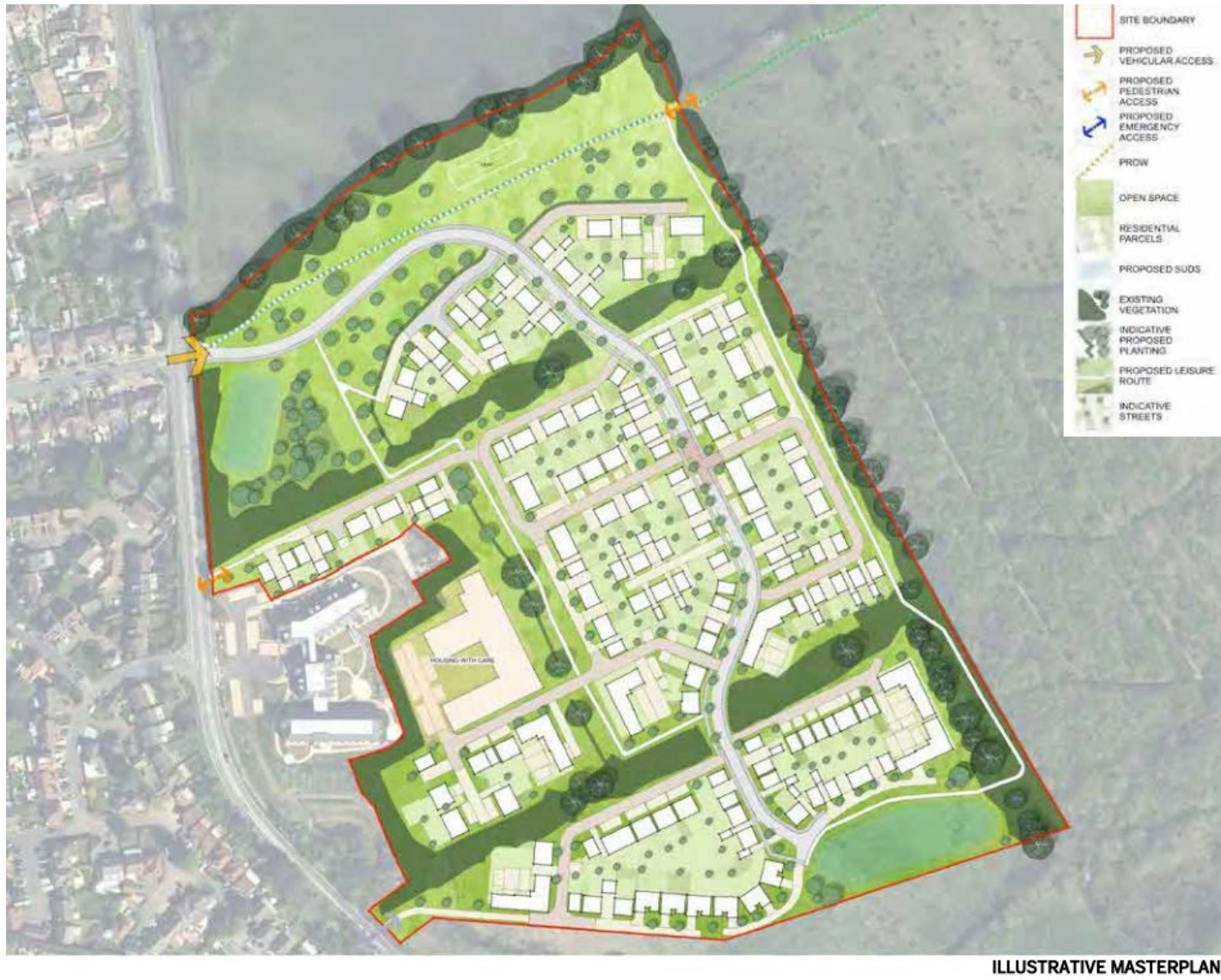
Illustrative Masterplan DAS section (pdf page 42)