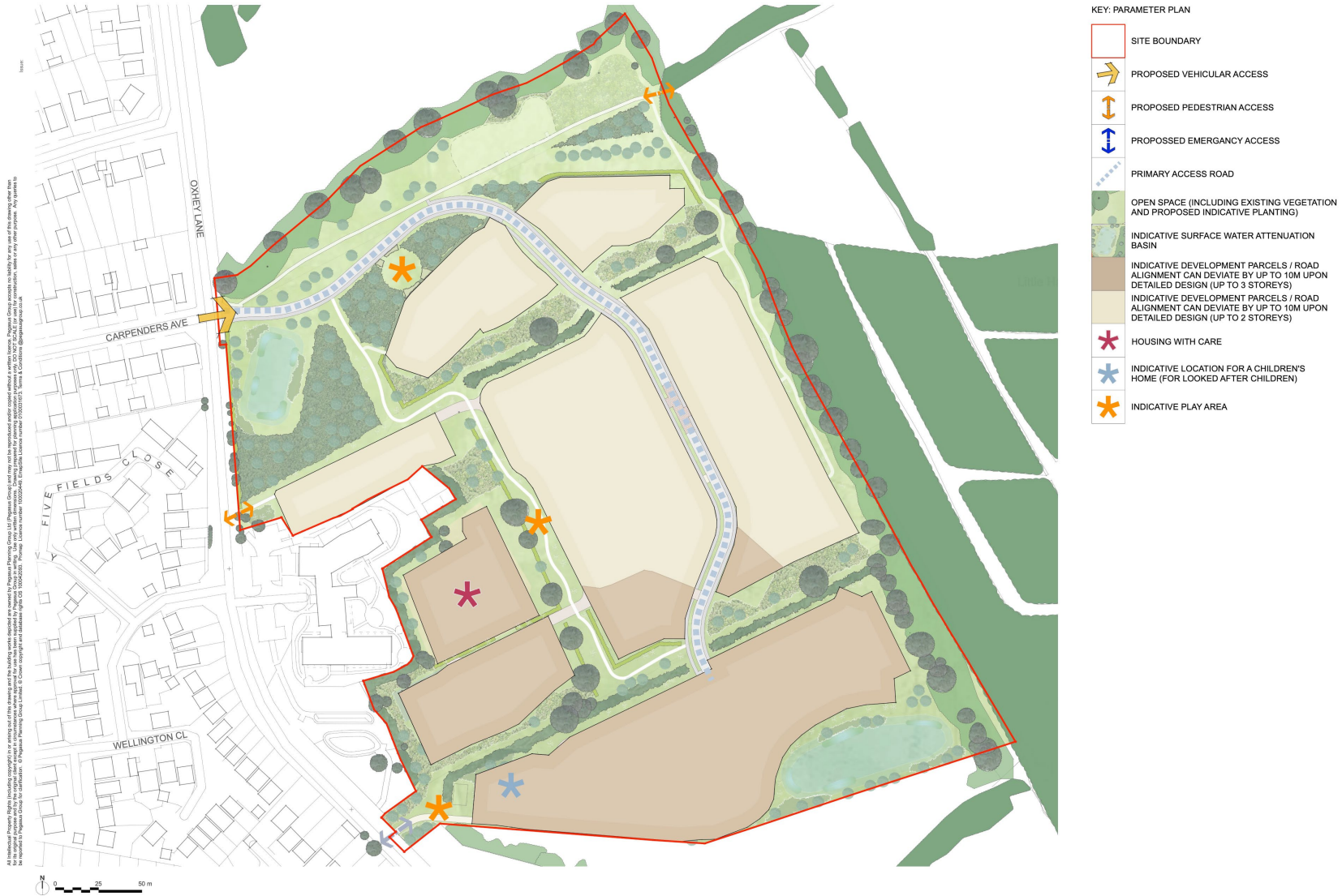
Amended Parameter Plan